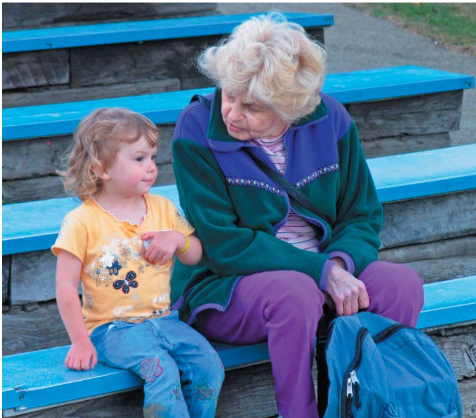
Listening to the music at the after-dinner "Fiselekh, Fiselekh Family Dance"—in the bleachers in front of the KlezKanada Dining Hall.