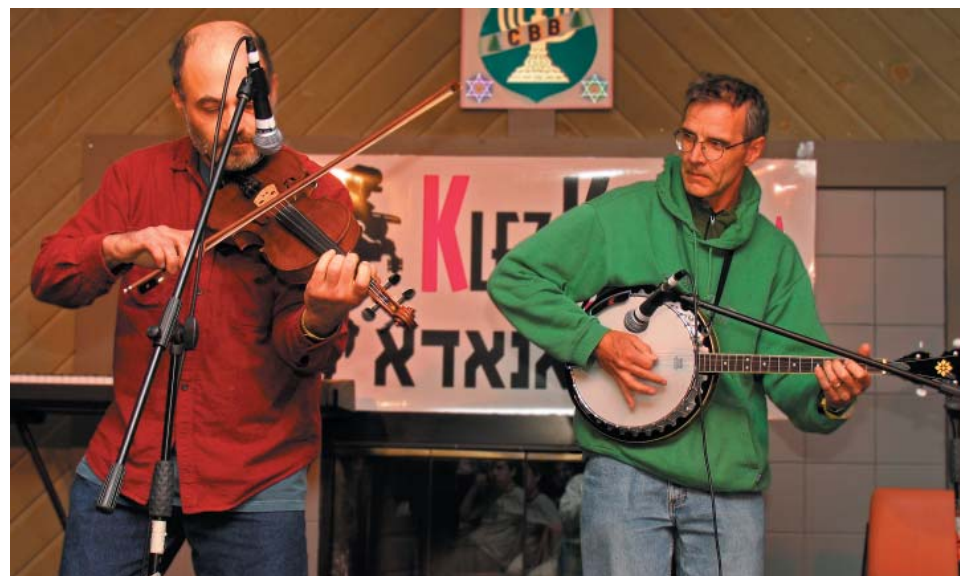
At the KlezKanada Cabaret.