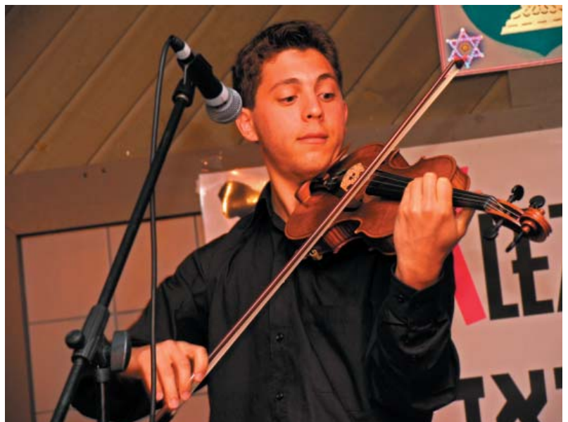
At the Klez Cabaret

The number I wish to call will never be completed as dialed The number I wish to call will never be completed anymore