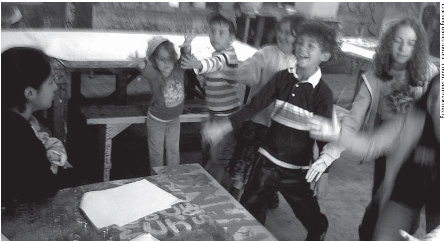
"Learning Dance Moves"